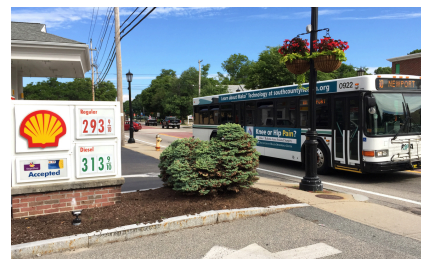
One gallon of gas costs about $1 more than a trip on RIPTA. You decide!

Summer 2018 is a great time to “dump the pump” and give public transportation a try! Gas prices are already hovering around the $3 mark and are predicted to climb even higher. Try riding with us the season – whether it’s to work, summer classes or seasonal attractions.