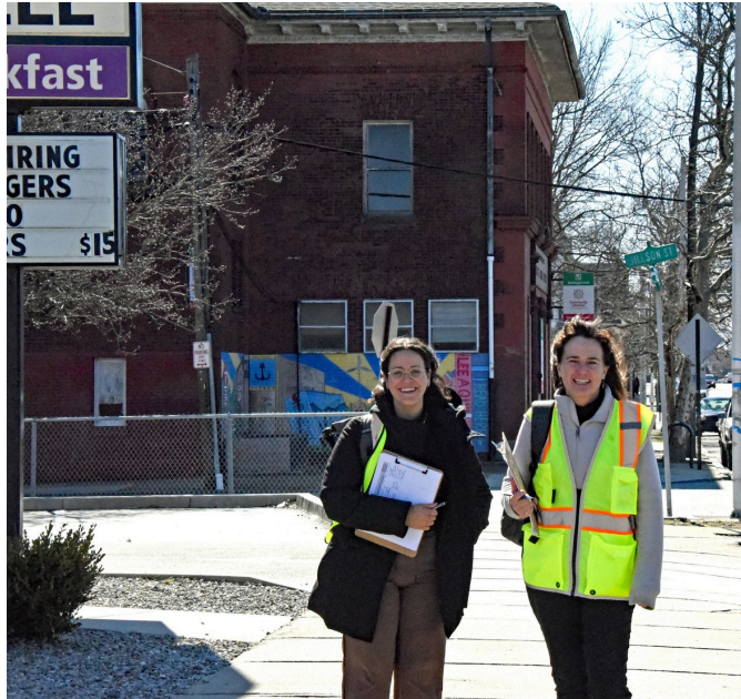
RIPTA outreach consultants visit businesses along the R-Line this week.

Initial data shows that the free fare pilot program on the popular R-Line is resulting in increased ridership. And we are now also doing further research to see how ridership trends affect businesses along the R-Line route, which runs from the Providence-Cranston line into Pawtucket. Our friendly consultants recently visited local businesses to get their valuable feedback. Some local shops have already noticed a difference, with business owners noting that the free service benefits their employees as well as customers.