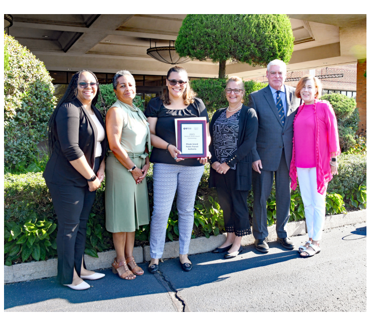
RIPTA's HR team smiles for the camera with RIPTA CEO

Whether it's getting a flu shot, going for a walk, or making sure you get your annual physical, RIPTA encourages its employees to be healthy. Last month, RIPTA received a Worksite Health