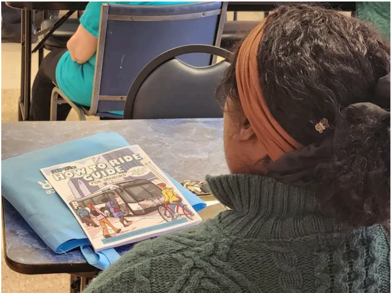
Image of woman with a "How to Ride Guide for Seniors" booklet in front of her.