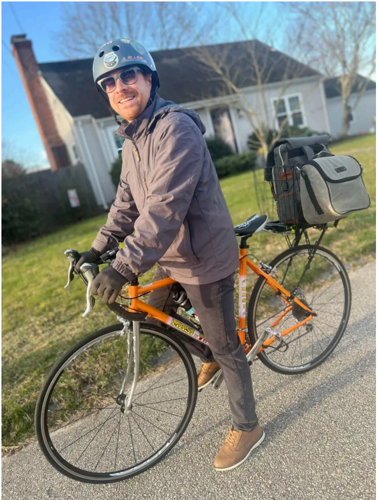
A bike buddy smiles while standing with his bike.