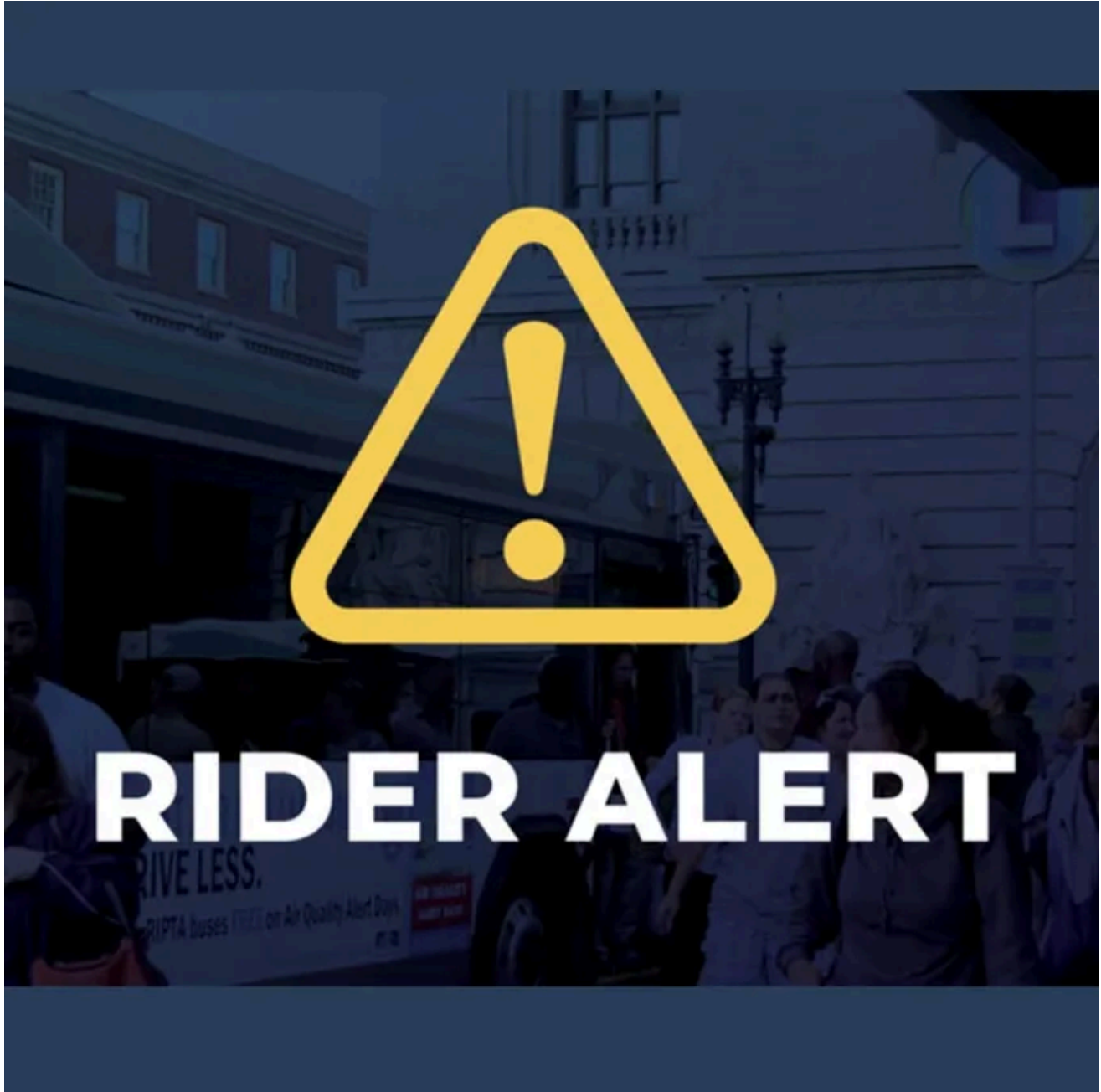
Rider Alert Graphic.

For information on how to qualify for RIPTA's Reduced Fare Program for Seniors and People with Disabilities, customers can call (401) 784-9500, ext. 2012 or visit RIPTA.com/ReducedFare .