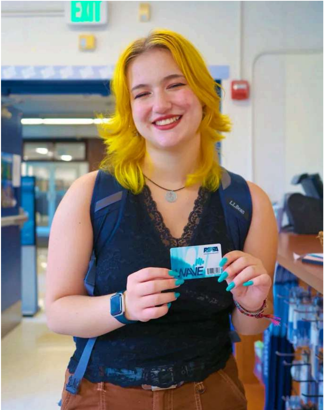
Young woman holds Wave smart card.