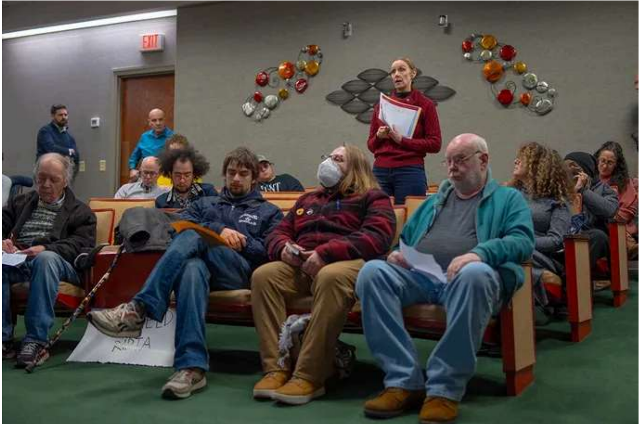
A woman stands and speaks while holding papers in a public meeting room, addressing a seated audience.