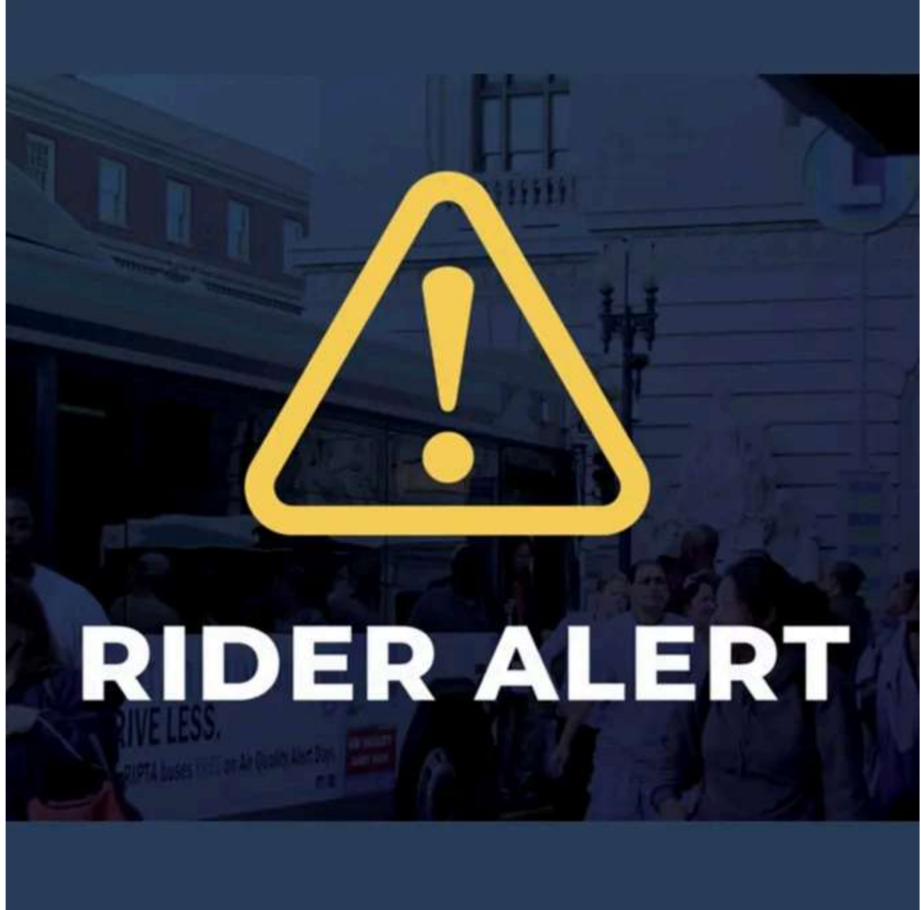
Rider Alert Graphic.